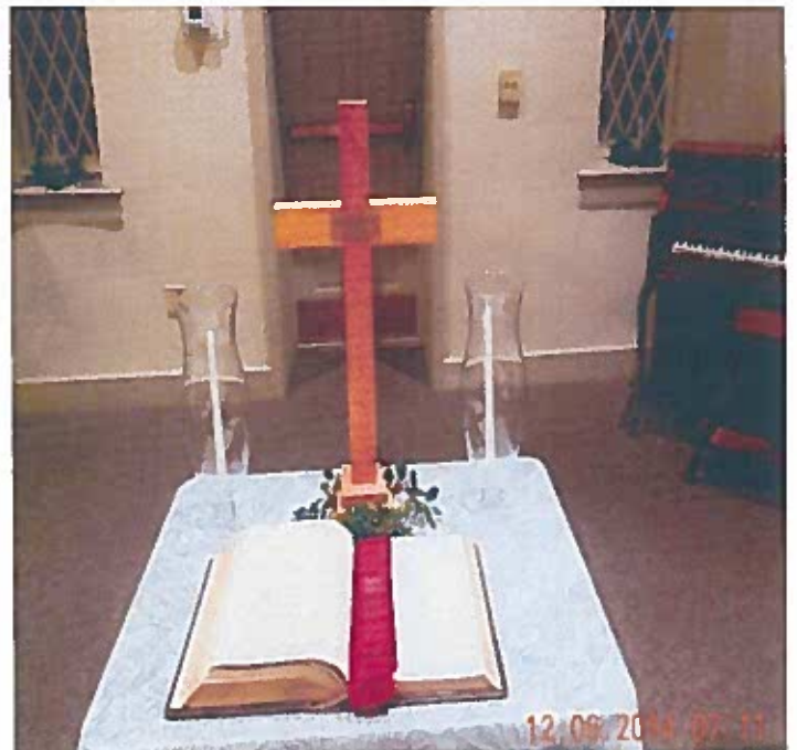
SANCTUARY TABLE DECOR, SOCIETY CHRISTMAS CHAPEL SERVICE, 2014