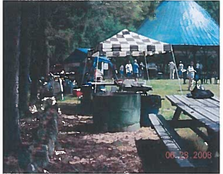
MONT ALTONIANS ENJOYING MONT ALTO PARK DAY SPONSERED BY MAHS