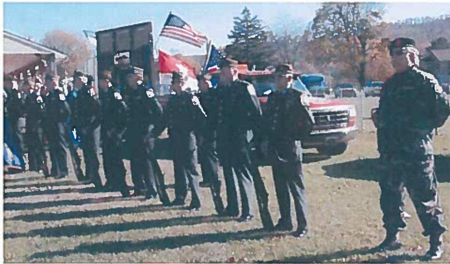
CHAMBERSBURG VFW PARTICIPATING IN HISTORICAL SOCIETY CEREMONY HONORING VETERANS, NOVEMBER 5, 2011