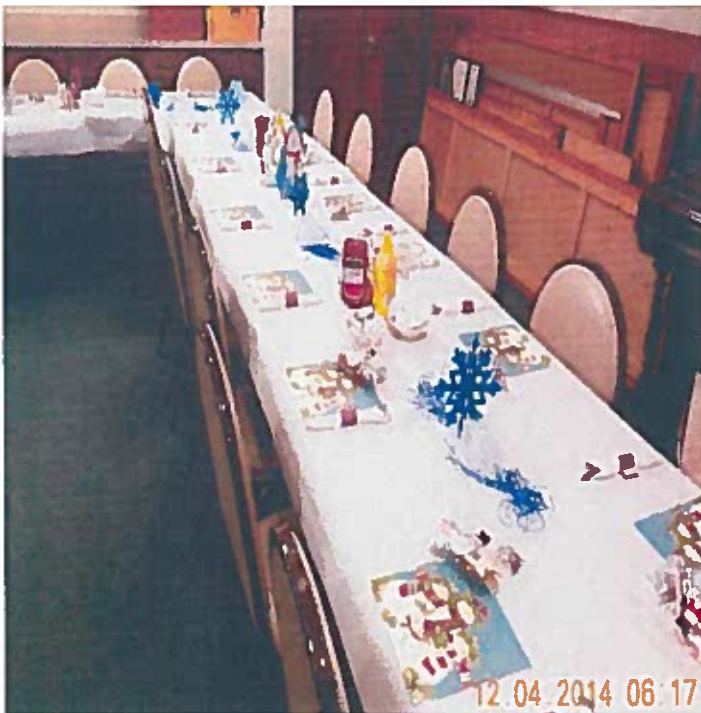
SOCIETY CHRISTMAS BANQUET, PARLOR HOUSE RESTAURANT, 2014.