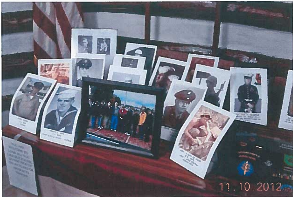
VETERANS' PHOTOS ON THE TABLE OF HONOR AT THE MAHS VETERANS' DAY CELEBRATION, NOVEMBER 10, 2012