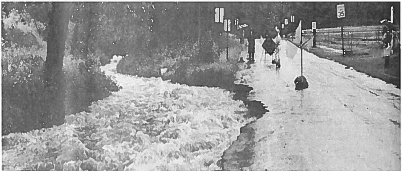
Antietam Creek swollen from storm Agnes undercuts roadway (Rte. #233) in front of Penn State Mont Alto campus.