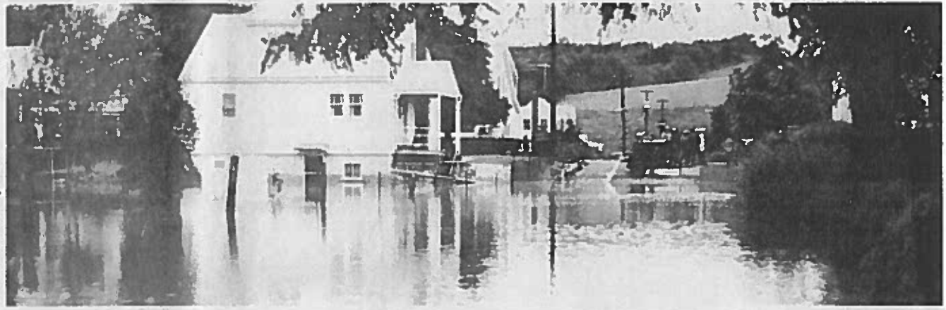
Mont Alto's Jones Avenue became "Jones Lake" as a depression west of the Constitution Avenue intersection filled with water and spread over neighboring properties. Numerous pumping details attacked the lake and one with a heavy-duty pump began to make progress Friday afternoon.

In the spring of 2017, the Mont Alto Historical Society hopes to have an extensive display of photos, newspaper articles and stories of Mont Alto and Franklin County during the storm. The exhibit will mark the 45 th anniversary of this weather event. The display will take place during the Franklin County Spring-into-History-Tour. We are asking the public to share your photos and stories with the Society as we want to make this exhibit very special and preserve the memories of this historical weather event.